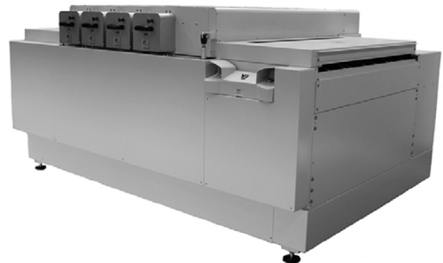
Typical Set-Stack Unit

F803 11/17 EN Subject to technical modifications. Products marked with ® are registered trademarks of IST METZ.