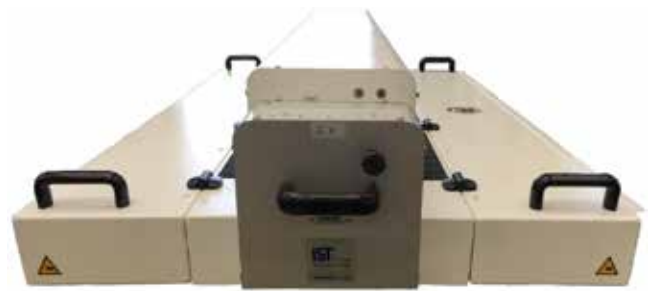
IST UV interdeck curing