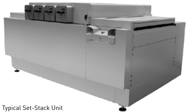
Typical Set-Stack Unit